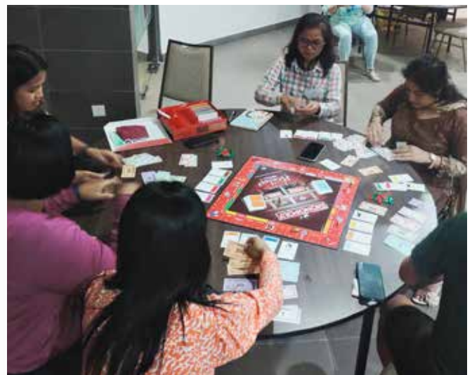
// GEM School students play Monopoly to understand how the economic system serves those who have resources. //

Florence Iminza from Kenya also shared a proposal to initiate a survey as a base for churches' work for just taxation including of extractive industries in Africa. For Iminza, a key