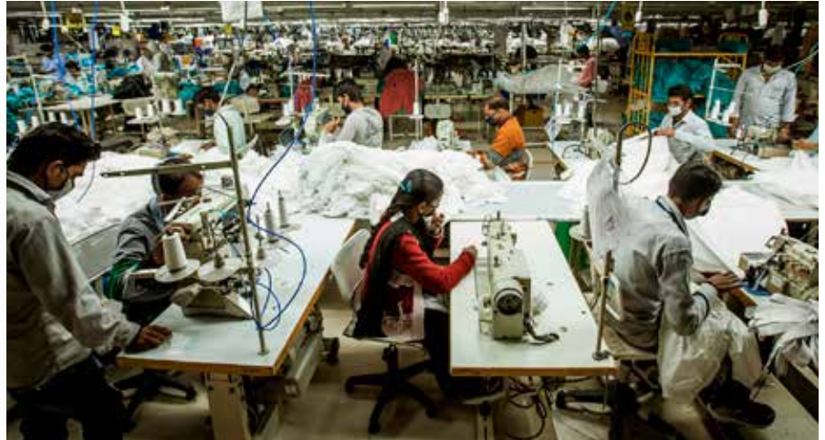
// Workers producing clothing at the Pratibha factory, India. //

Stories and case studies from participants emphasized that under the present economic system labour continues to be exploited. Decades of neoliberal globalization have shaped labour migration within and beyond national borders as well as eroded wages, social security, and other hard-won rights. Among the most vulnerable groups of workers are racialized communities, youth, and women. In particular, women’s productive and reproductive labour is often unpaid/underpaid and unrecognized work. Climate change, as well as rapid technological changes reflected in the “gig economy,” have further deepened workers’ vulnerability.