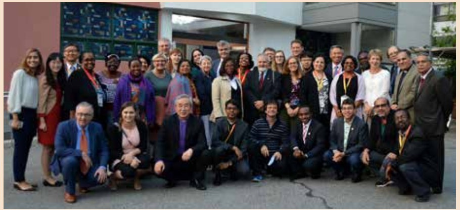
Members of the WCRC Executive Committee immersed themselves in the Korean context, including through worship with local congregations in Seoul.

During the Executive Committee meeting, which was held 10-16 May, the WCRC also issued specific statements calling for prayer and solidarity in the wake of attacks on churches in Indonesia, condemning the Israeli violence in Gaza and welcoming the Panmunjom Declaration for Peace, Prosperity and Unification of the Korean Peninsula. ●