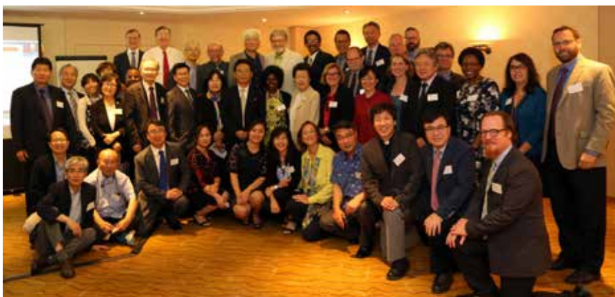
Koreans from both sides of the DMZ attended the latest Ecumenical Forum for Peace, Reunification and Development Cooperation on the Korean Peninsula (EFK), held in Geneva in June, and issued a call to "Seek Peace and Pursue It."